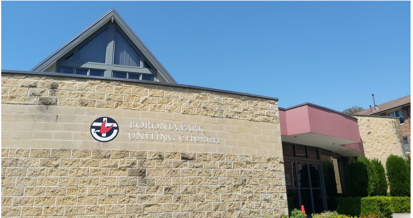
The church building front